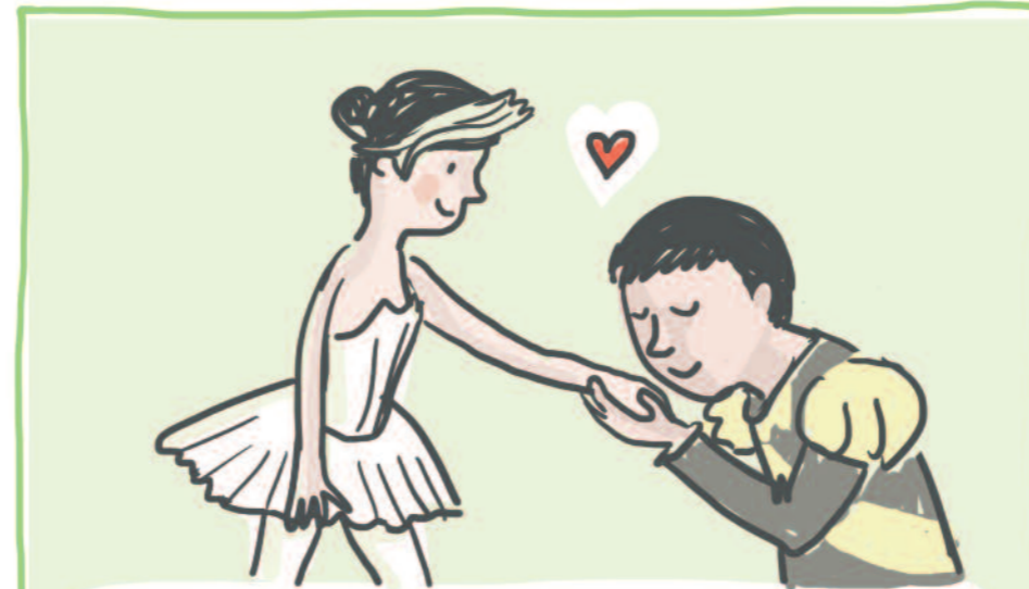
Only true love can break the spell.