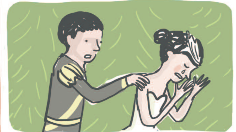
As soon as Siegfried makes his promise he realises his mistake. He rushes back to the lake, to find Odette and explain what happened.