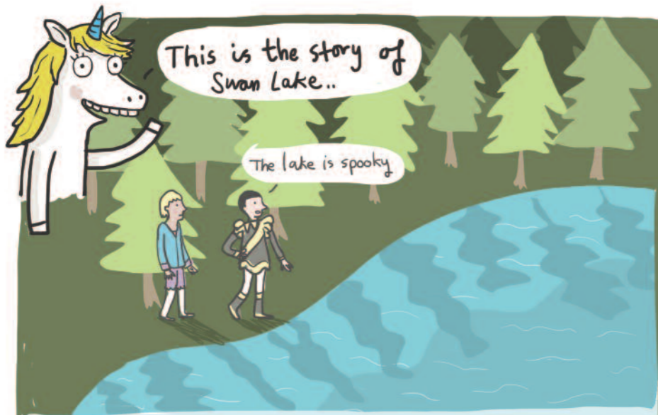
Prince Siegfried is walking by the lake in the forest with his friend Benno.