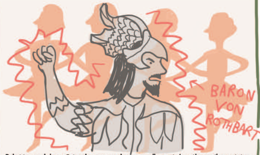
Odette and her friends are under a spell cast by the evil magician Baron Von Rothbart. By day they are swans, at night they become princesses again.