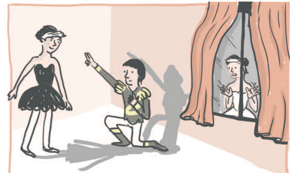
Odette appears at the window but no-one sees her. Odile tricks Siegfried into saying he loves only her.