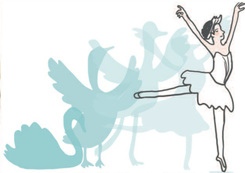
He sees a beautiful white swan. As he looks at her she changes into a young woman, Princess Odette.