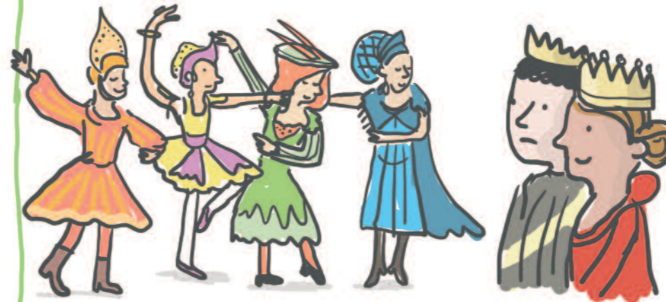
It is Siegfried's birthday and there is a ball at the palace. Siegfried's mother has invited princesses from around the world. She wants Siegfried to marry one of them.