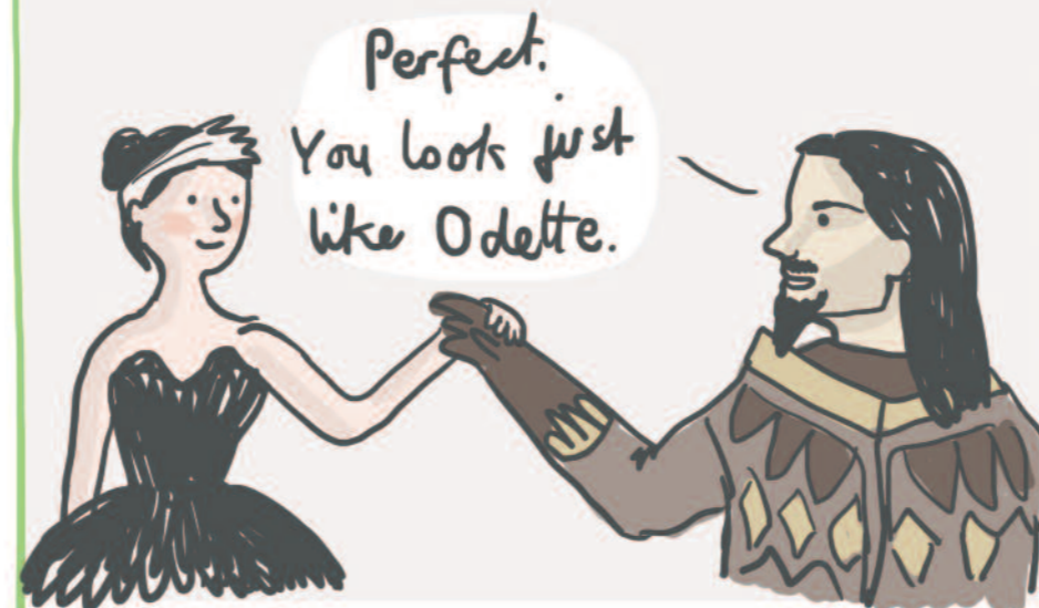
A beautiful woman arrives. She looks like Odette, but she is the evil magician's daughter Odile in disguise.